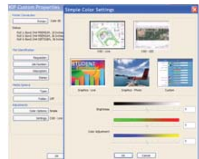
Color Printing Options